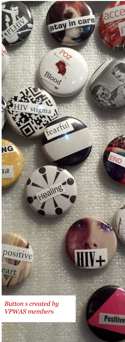
Buttons created by VPWAS members