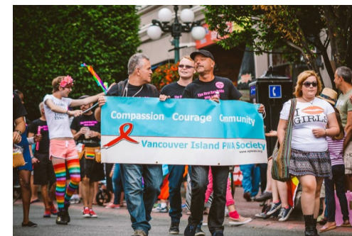
Victoria Pride Parade 2014